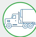
Truck & Trailer