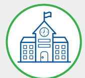
Schools & Govt. Offices