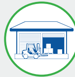
Warehouse & Distribution Centers