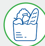
Retail Grocery & Storefronts